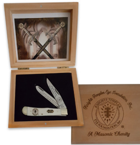
Steel Warrior Knife